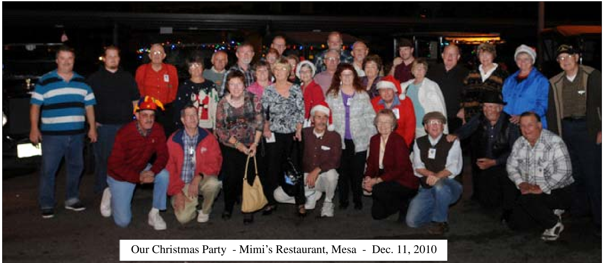
Our Christmas Party - Mimi's Restaurant, Mesa - Dec. 11, 2010