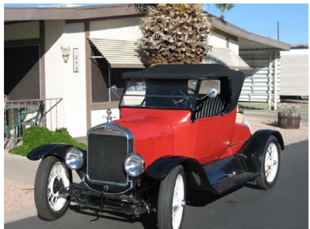
Finished but never finished—top speed 66 mi/hr