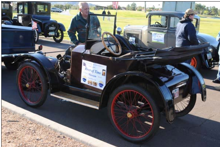
Fountain Hills Thanksgiving Day Parade - Nov. 25, 2010 A mighty Chilly drive from Tempe