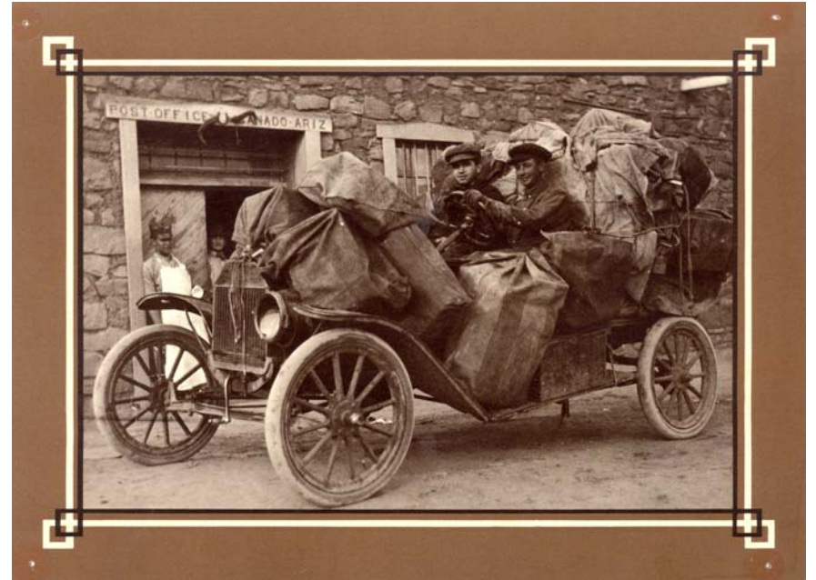
Hubbell Trading Post - Navajo Reservation, Ganado, AZ