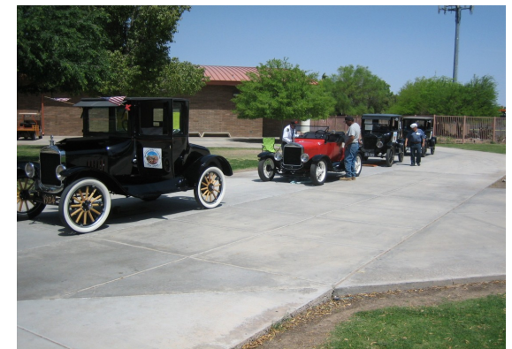
A visit to Corona Del Sol High School - April 14, 2011