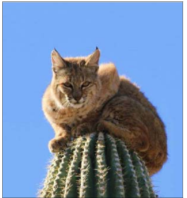
What a revoltin' development this is - "Saguaro'd" by a Mountain Lion