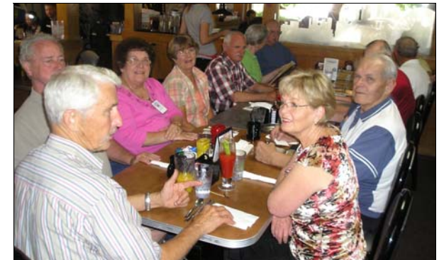
Breakfast at Chompie's followed by a visit to the Arizona Historical Society Museum at Papago Park - April 16, 2011