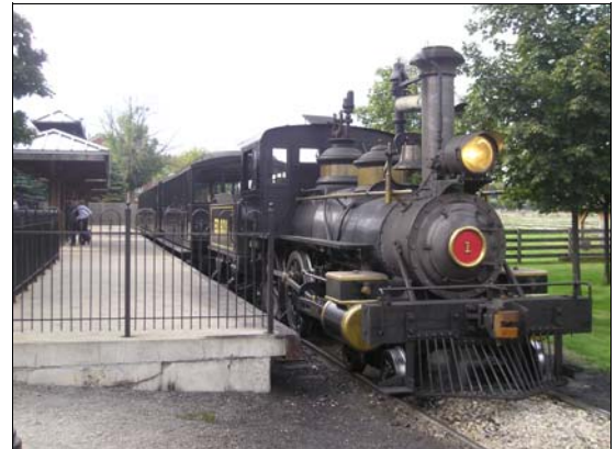
Steam powered locomotive named Edison