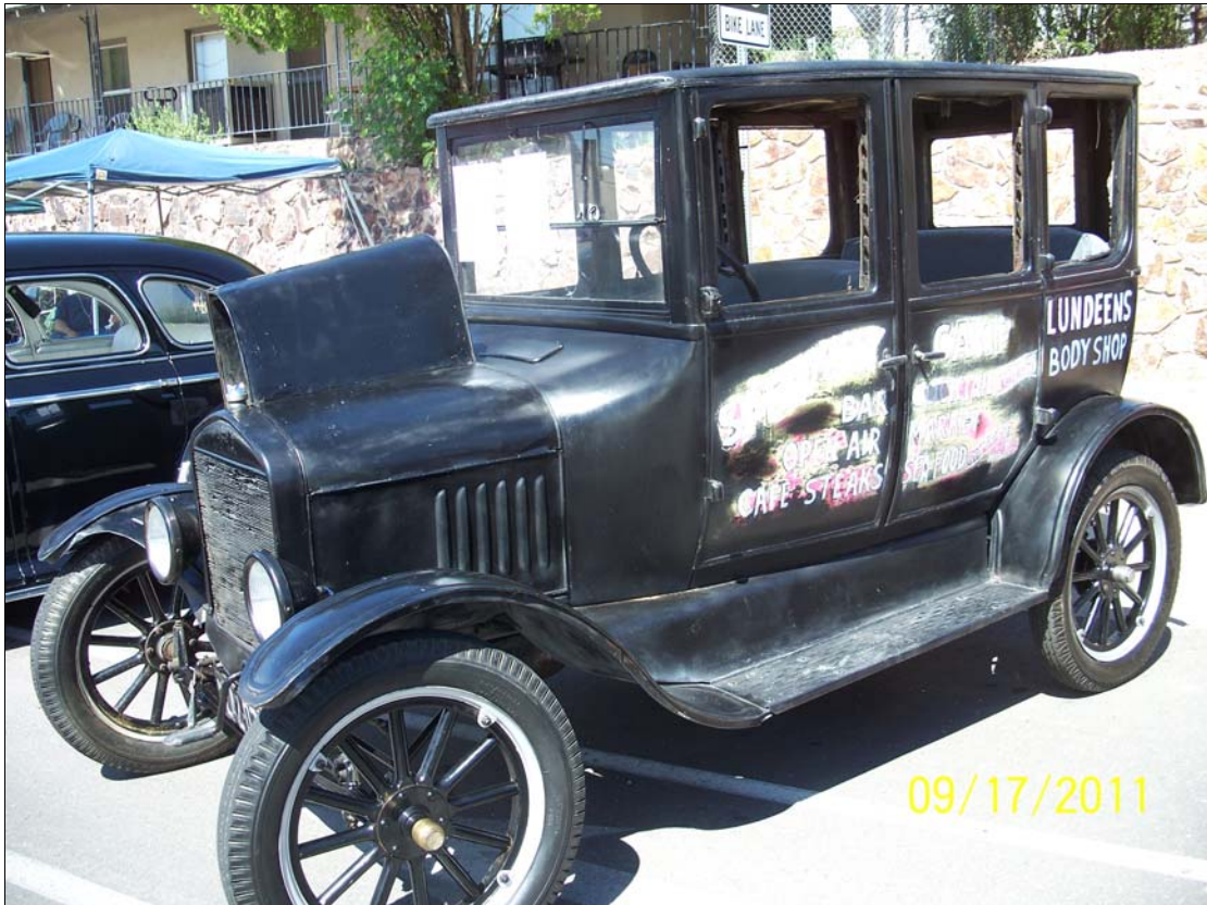
Ronnie Johnston's '27 Fordor Sedan at the Superior Car Show along with 100 other showpieces - Sept. 17, 2011