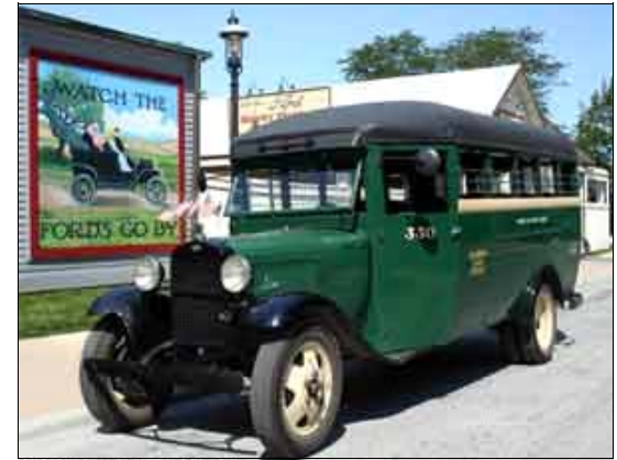
1913 Model AA Bus