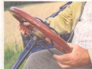
Das Holzenkrad lässt sich überraschend leicht drehen.