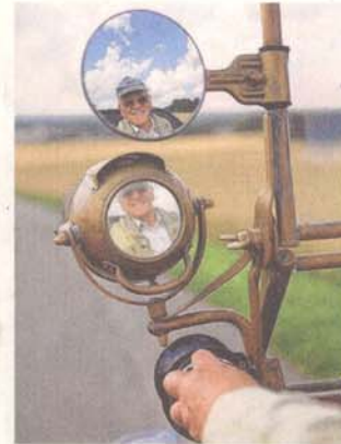
Spiegel und Lampe hat der Eigentümer passend nachgerüstet.