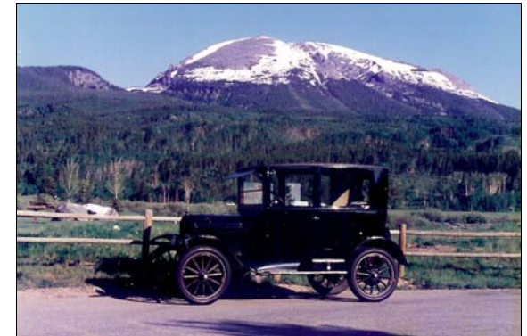
Ride-the-Divide Tour in Frisco, Colo.: Wow! This is what I expected!