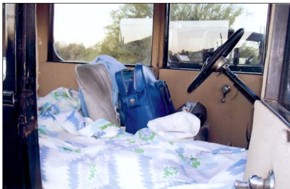
Sleeping Quarters for One: Eighteen wheelers have nothing on me