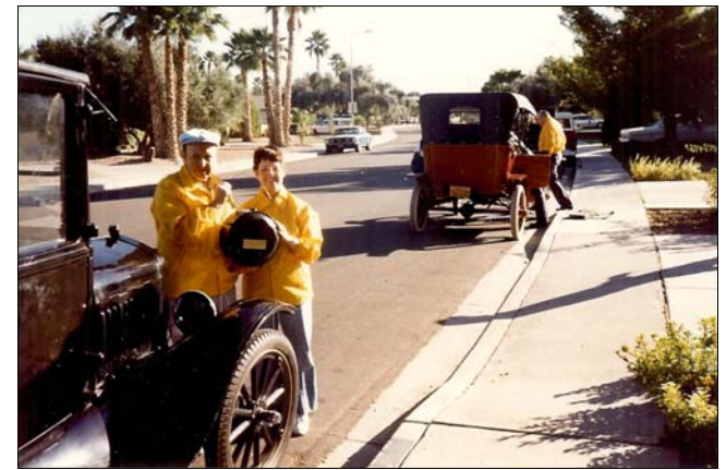
Hard-Luck Trophy: I had a bad air day - so what?