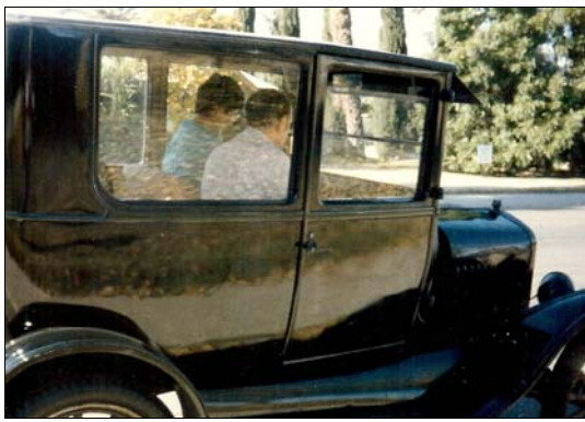
Test Drive: It's easy. Pull my ears down and I'll go.