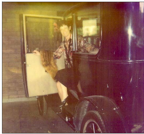
Ready for a Night Out: At least she knows how to dress well.