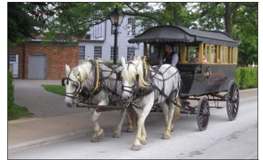
Omnibus - horse drawn bus-like carriage