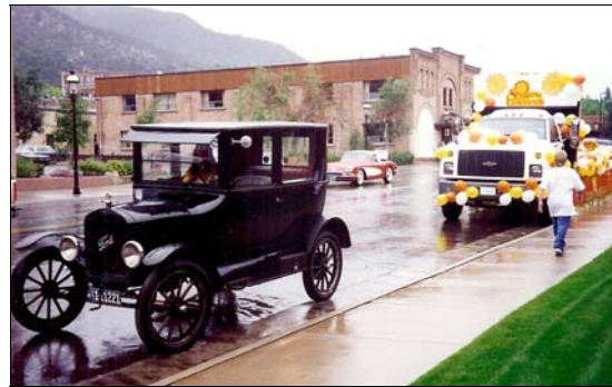
Strawberry Day in the Rain: I came to Colorado for this?