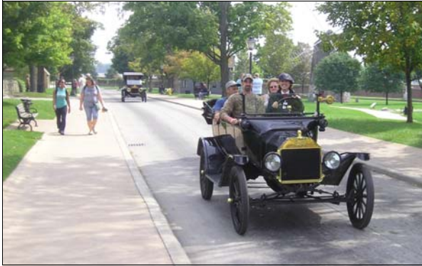
1913 Model T (one of 13 available for visitor rides)