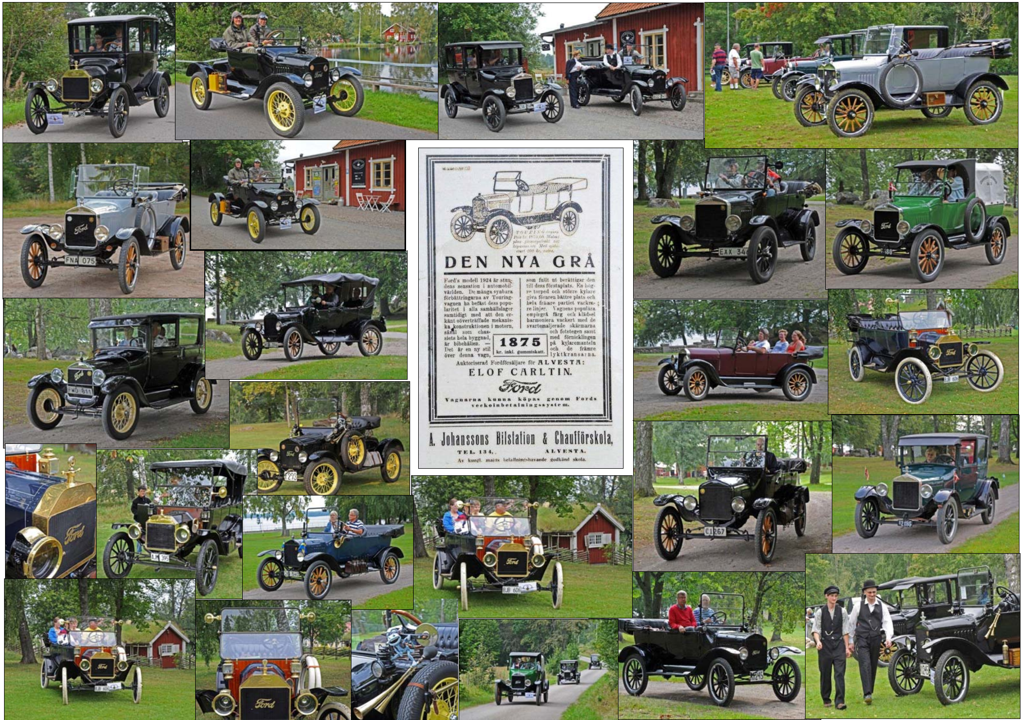
A portfolio of great T's from Dave's friend in Sweden