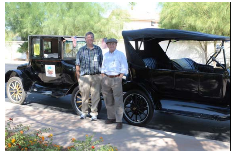
Westminster Facility Parade, Scottsdale - September 22, 2011