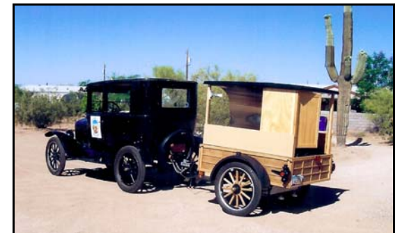
First Pull of New EVMTFC Chuckwagon: For fancy cuisine I'll bring my friend Lazy Lizzie.

Lizzie Jane's first 25 years in the Peterson family: I may be ageless, but they sure are not. Lizzie Jane