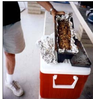
Manifold Meatloaf: Just don't ask for a souffle.