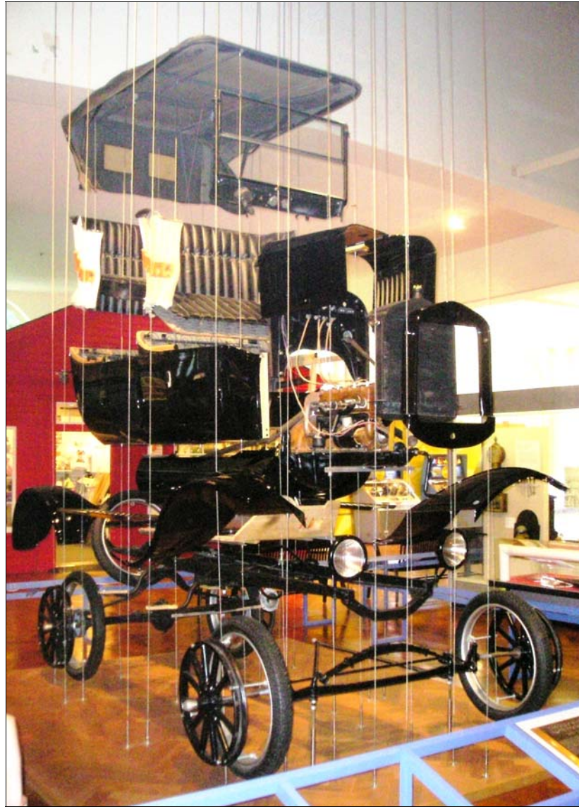
Model T in Henry Ford Museum (not quite ready for prime time)