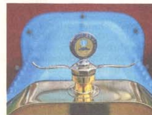
In der Kühlerfigur befindet sich ein Thermometer für den Motor.

„Tin Lizzie“ zu kriegen. „What's the problem?“, fragt der Neuseeländer. Drei Monate später bringt der Paketdienst die neuen Räder.