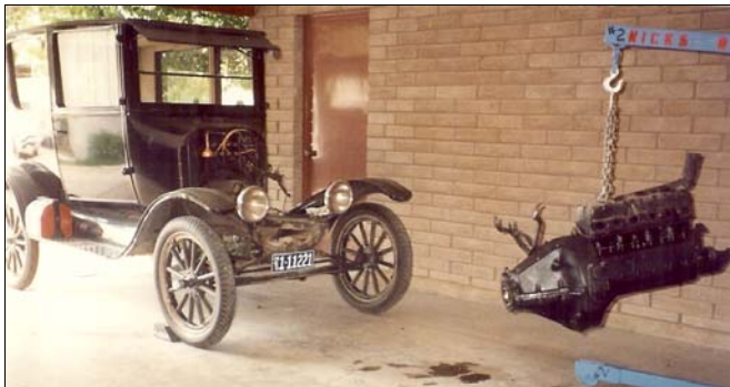
The Start of Her Sickness: Is it serious, Doc?