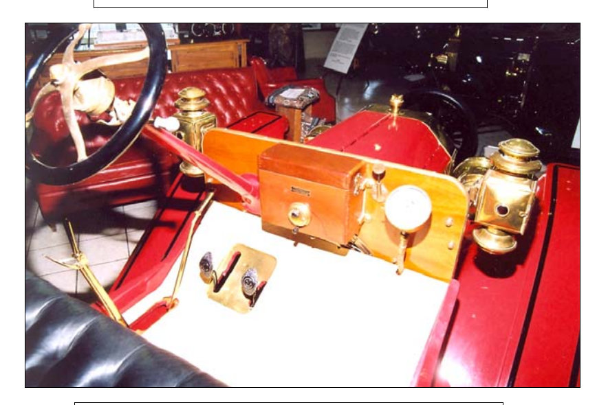
Interior arrangement of 2 pedals and 2 levers

Recent Additions to the MTFCA Model T Museum - Centerville, Indiana