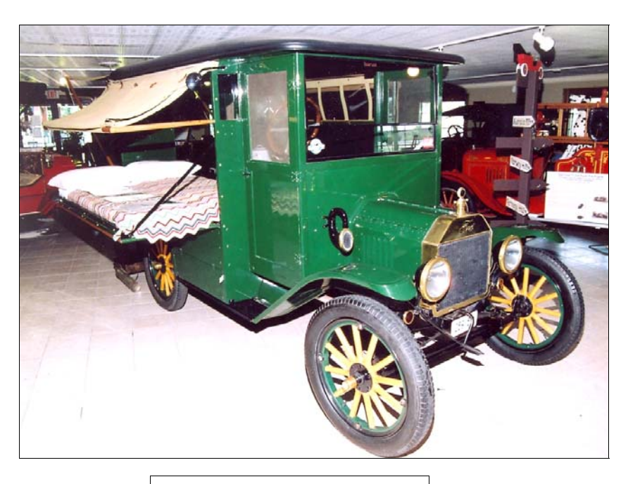
A 1915 Lamsteed Kampkar