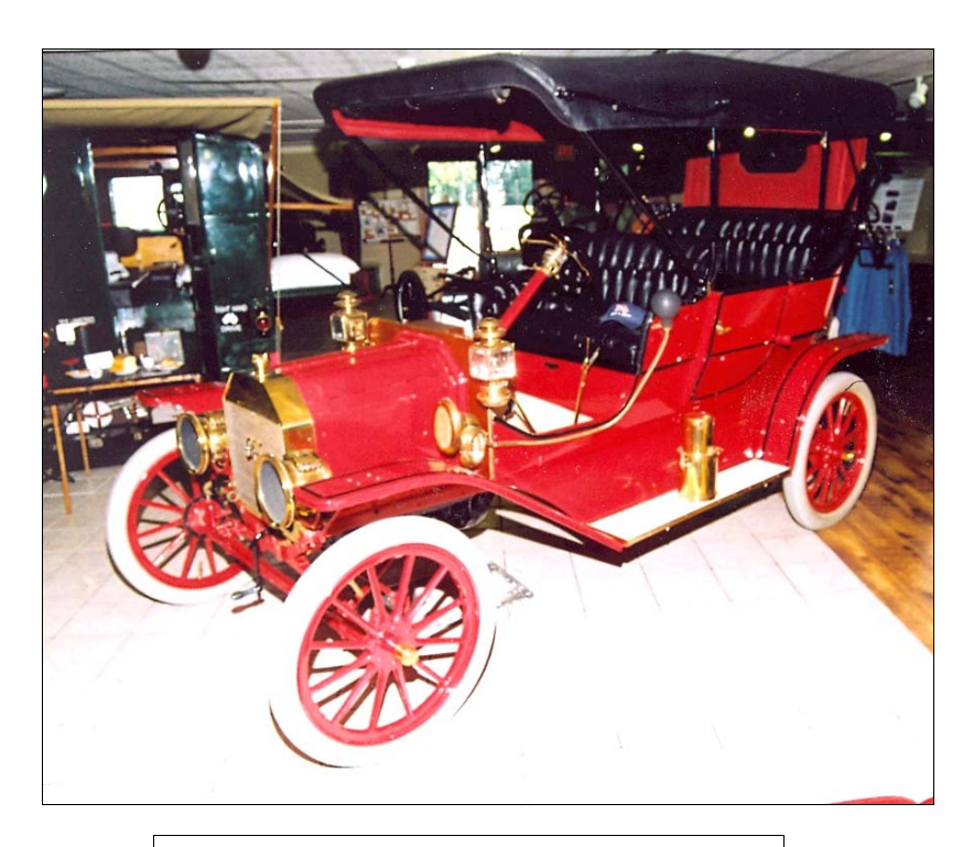
A rare 1909 2 pedal, 2 lever Touring Car