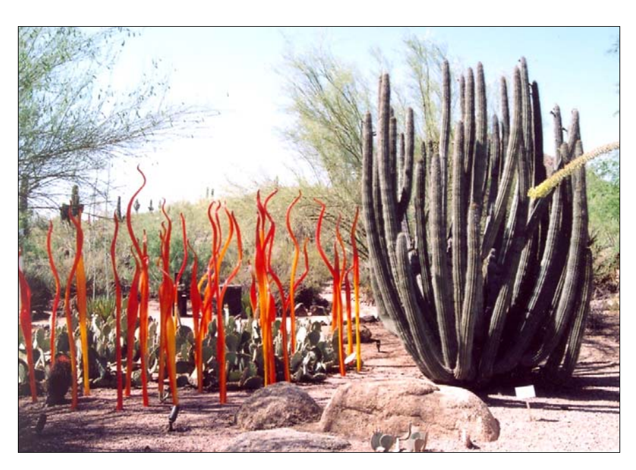
Our Members touring the Chihuly Glass Exhibit at the Desert Botanical Gardens - May 16, 2009