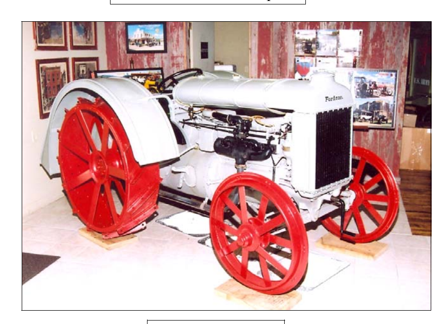
A Fordson Tractor