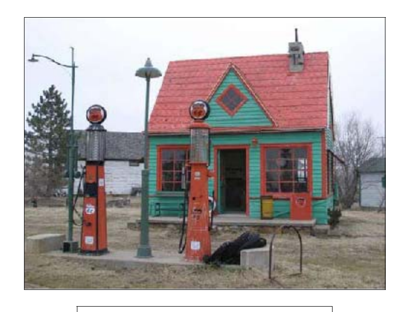
Old Gas Stations - No. 14 in a series