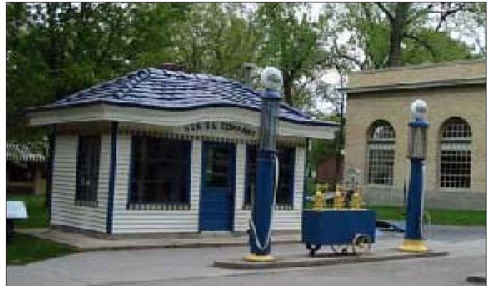
Old Gas Stations—No. 17 in a series