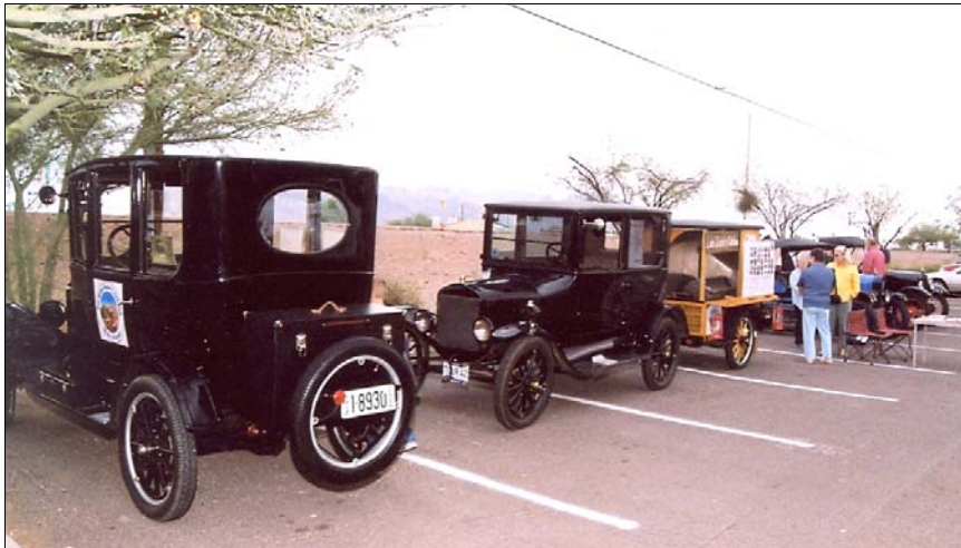
Central Arizona College Art Show - Nov. 14, 2009