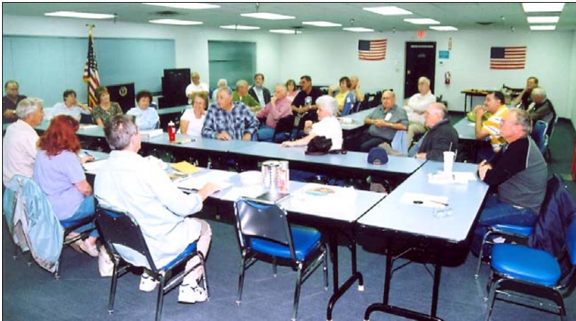
EVMTFC monthly meeting –Nov. 19, 2009

Feel like you need eyes in the back of your head? Get a "Cop-Spotter" mirror