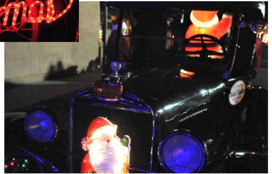
Apache Junction Parade of Lights - Dec. 4, 2009