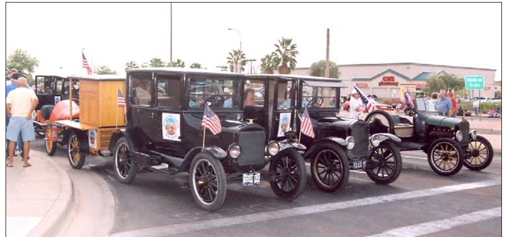
Apache Junction Veterans Day Parade - Nov. 11, 2009