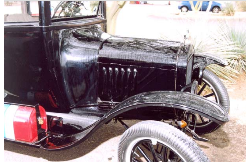
A "fair weather" CenterDoor in the rain Hey, look, it's shrinking, no it's melting !

that's what a "COP-SPOTTER" Auto Mirror will do for you. Reflects full view of the entire width of the road, from curb to curb, as seen through the rear curtain window, without detracting from your line of vision. You can adjust a "COP-SPOTTER" to any desired angle without moving from your seat—no screws to fool with—simply twist the mirror to the desired angle and it'll STAY THERE without rattling or working loose. Made of the very best material obtainable and mirror is especially prepared to withstand exposure to weather. Shipping wt., 3 lbs. B407-7", Open Car... 2.70 B409-10", Open Car. 2.95 B408-7", Closed Car.. 2.70 B410-10", Clsd Car.. 2.95