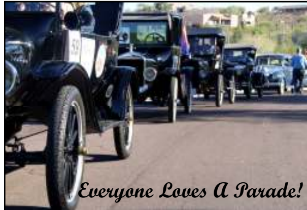
Everyone Loves A Parade!