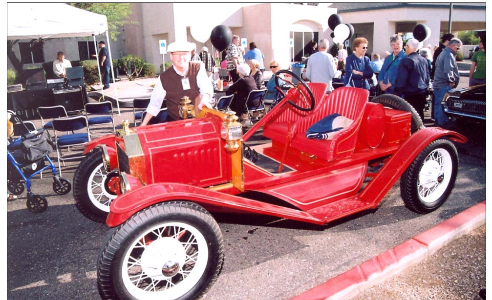
Discovery Point Retirement Community - January 30, 2010