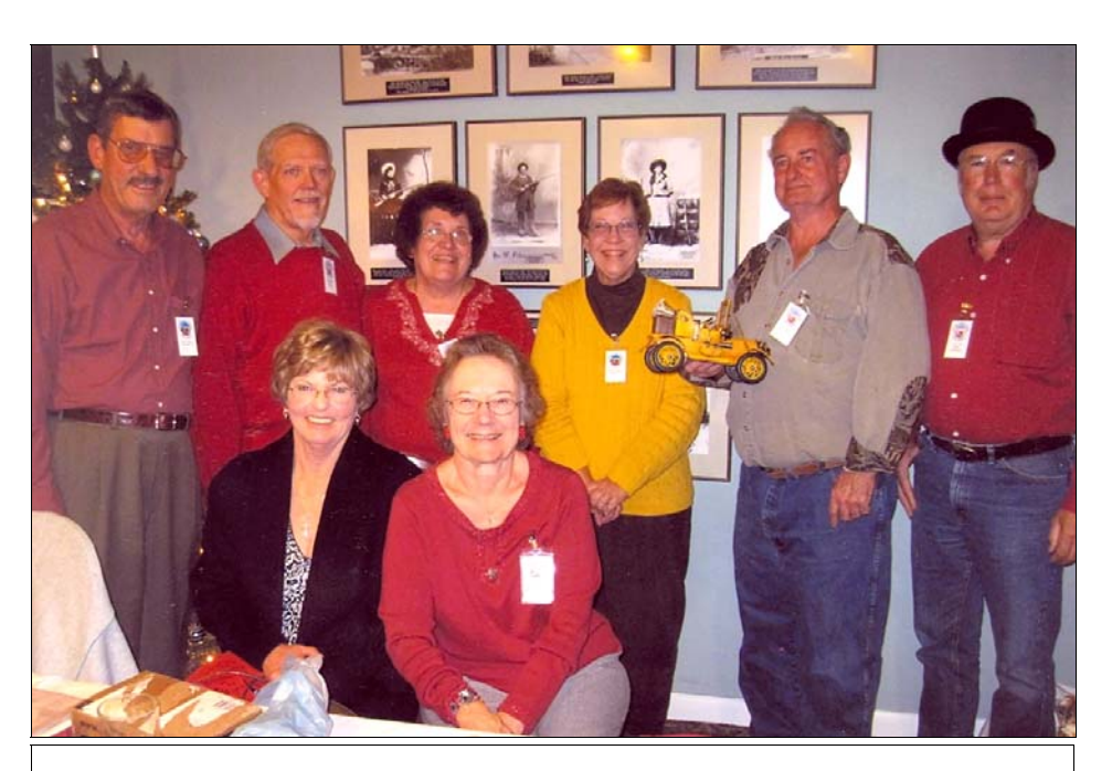
Serial owners of the "White Elephant" antique car