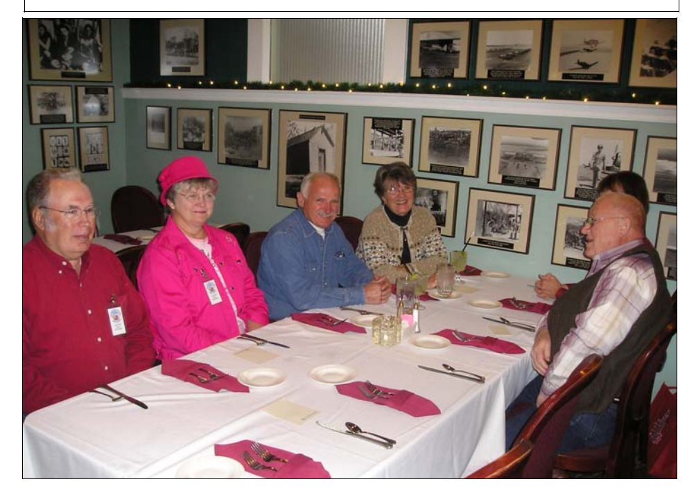
EVMTFC Christmas party - Landmark Restaurant, Mesa - December 12, 2009