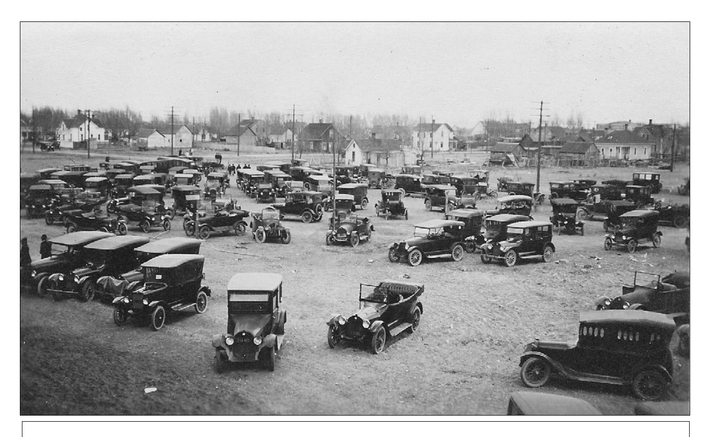
Their wives don't know they have all these old cars hidden in someone else's yard.