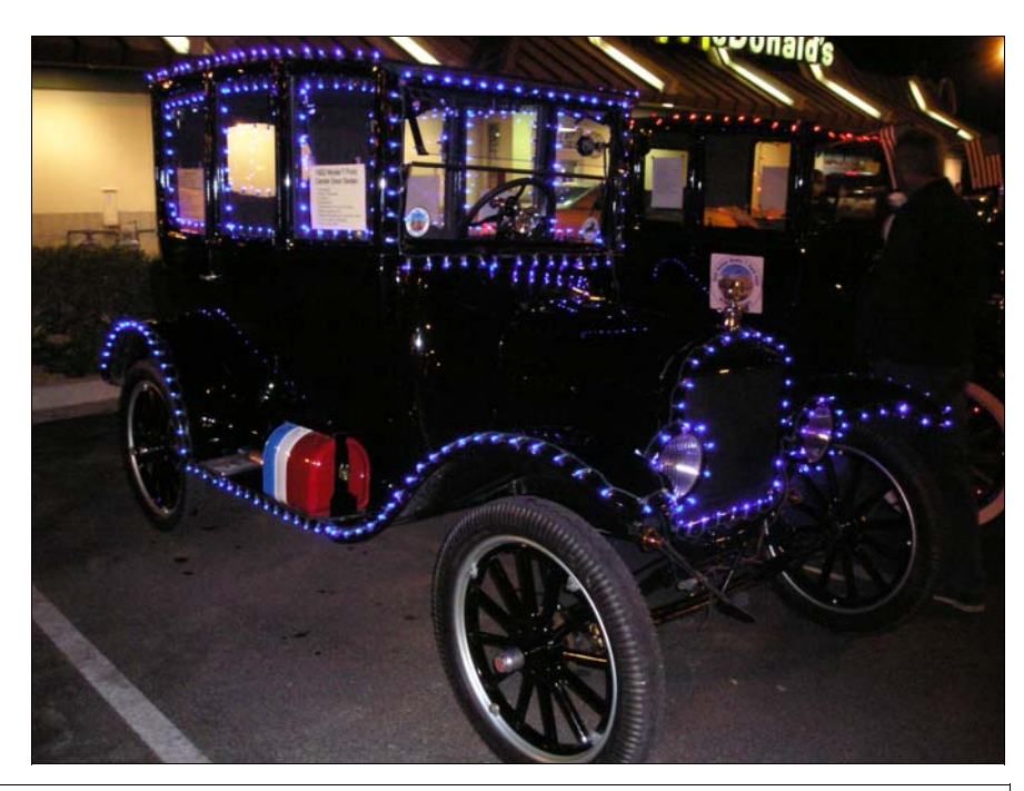
McDonald's Car Show - Scottsdale Pavilions - December 19, 2006