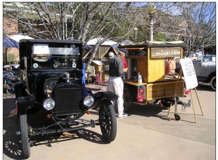
Motoring Thru Time at Heritage Square