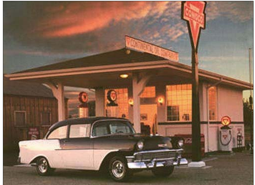
Old Gas Stations—No. 11 in a series