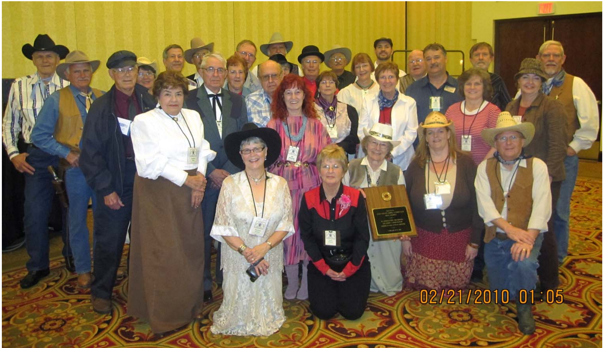
45th Annual MTFCA Meeting Feb. 19-21, 2010 Host Chapter—East Valley Model T Ford Club Mesa, Arizona