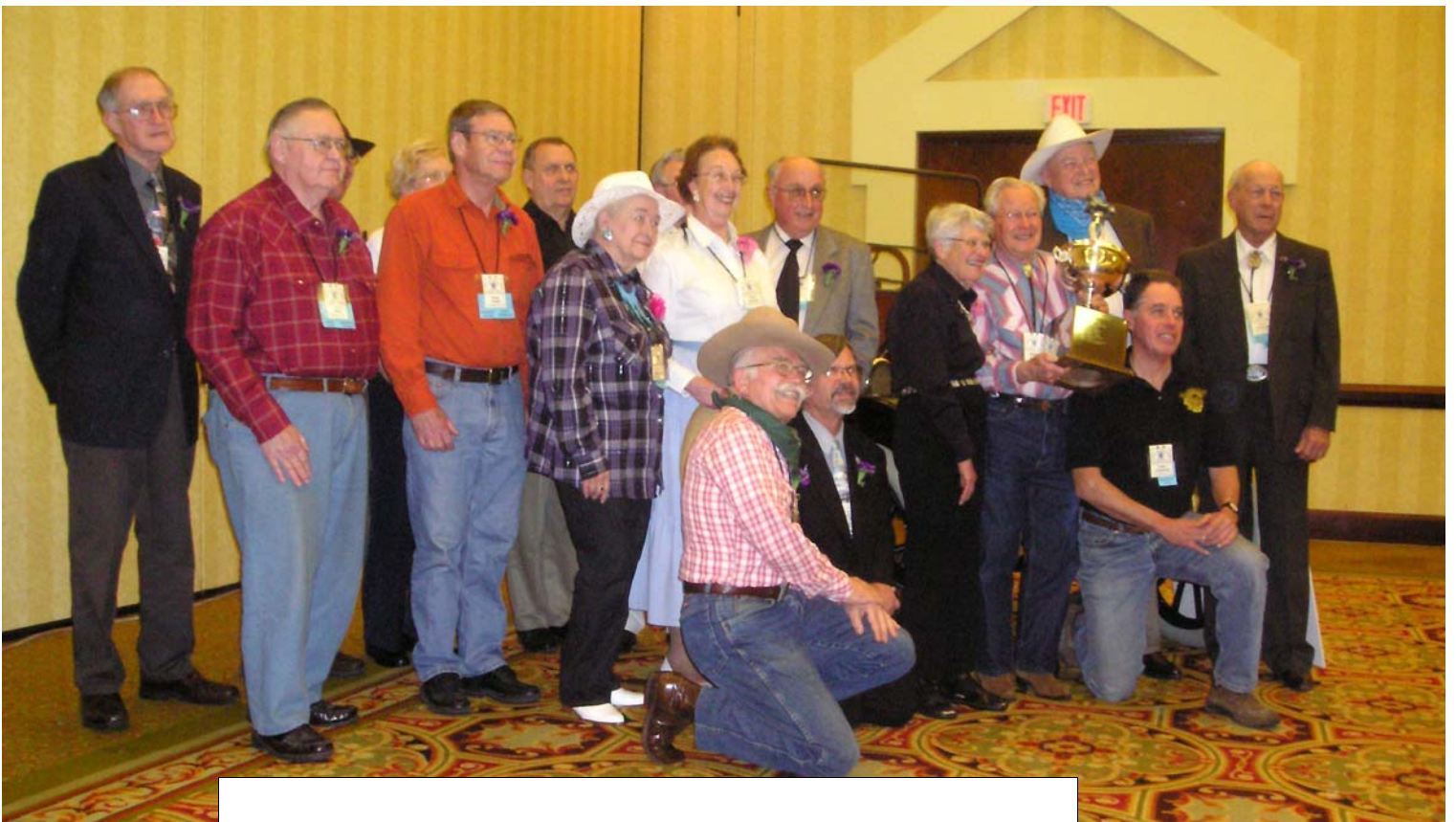
49th Anniversary gathering of Rosenthal Awardees