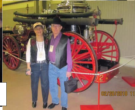
45th Annual Members Meeting