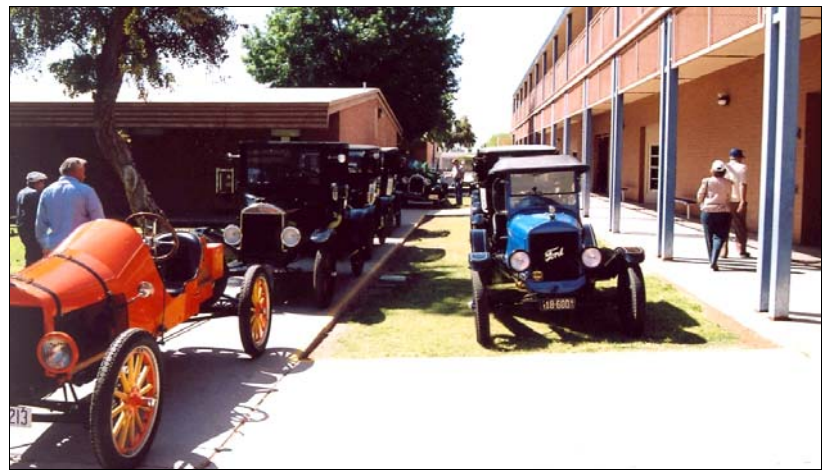
Lincoln Elementary School