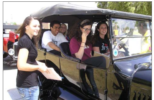
Generator Rebuild Clinic Sponsored by Sun Country Model T Club