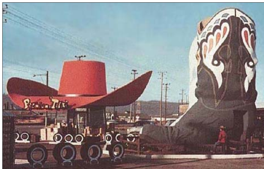
Old Gas Stations—No. 13 in a series