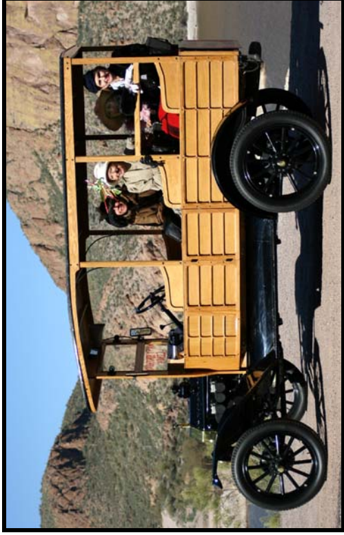
On the Apache Trail with Phil Rauso