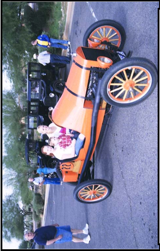
Guess we need twin "Mother-in-law" seats for Mom & Dad.