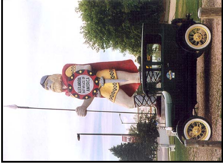
We're not even going to try outrunning this guy!