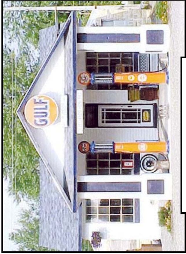
Old Gas Stations --- No. 7 in a Series