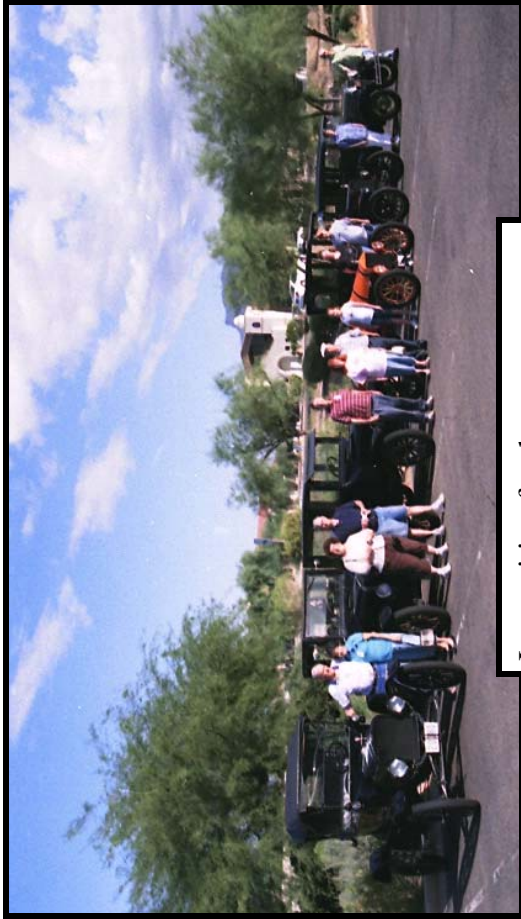
Just waiting for the tour to start