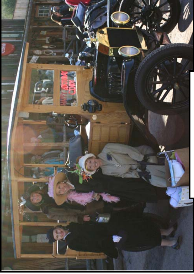
Elegant touring at Tortilla Flat