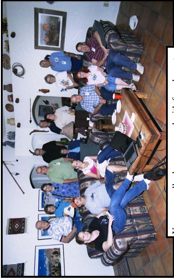
You can really draw a crowd with free dessert.