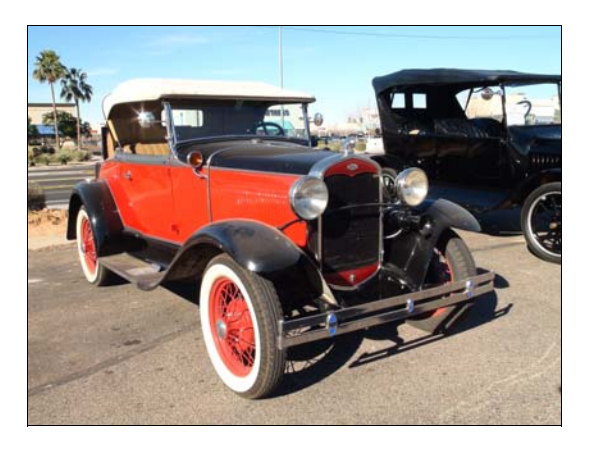
The first car show at Power Square, Mesa - January 15, 2011