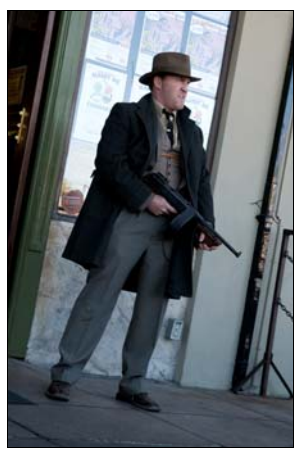
Tucson Dillinger Days, Jan 21 - 22, 2011