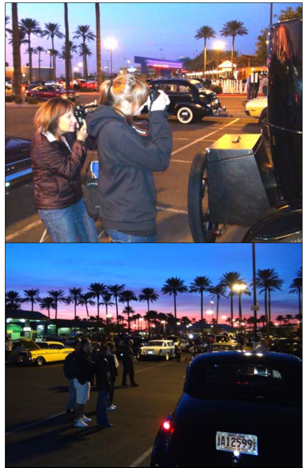
McDonald's Car Show - Scottsdale Same day