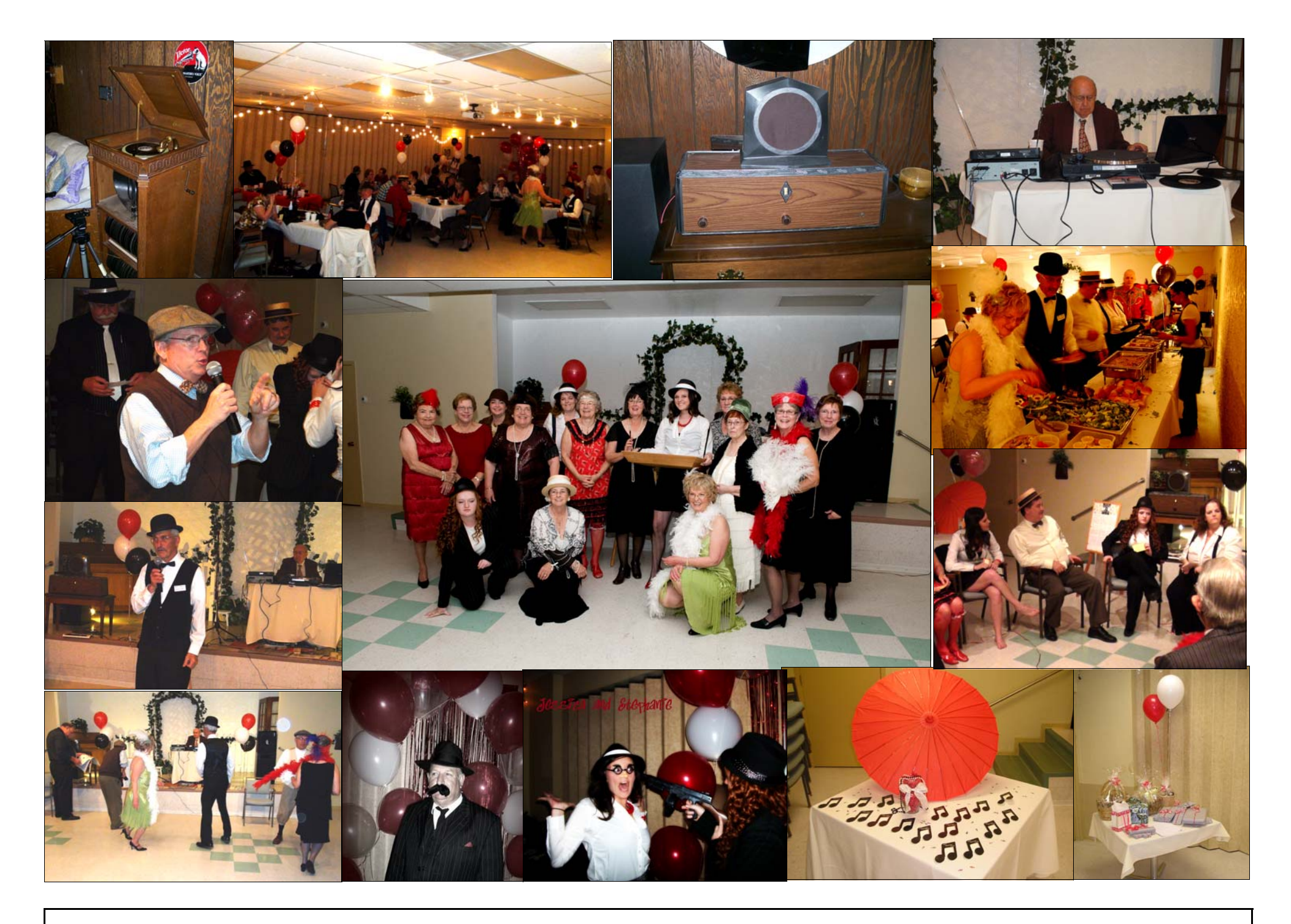
Roaring 20s Party - February 19, 2011