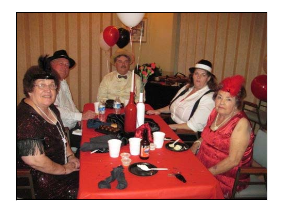
More Roaring 20s party