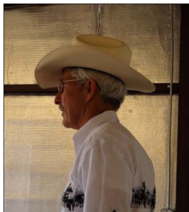
Post Parade Cookout