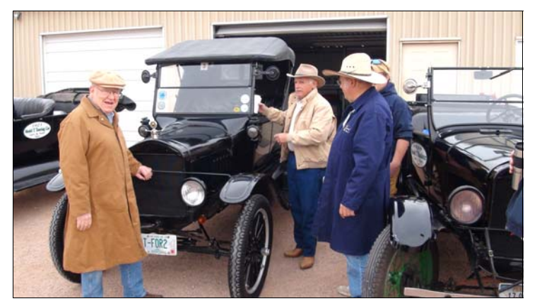
Lost Dutchman's Day - Parade Gathering at Allens - February 26, 2011