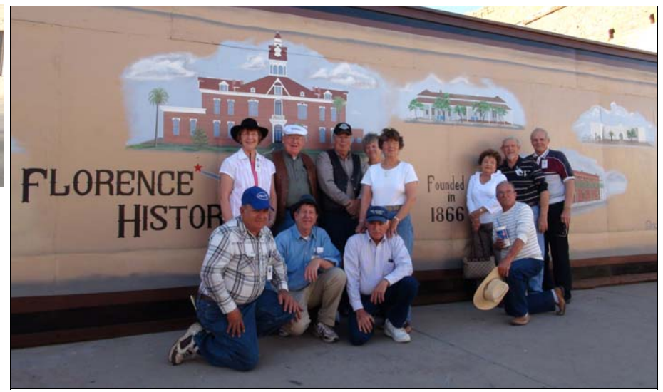
26th Annual Tour of Historic Florence - February 12, 2011