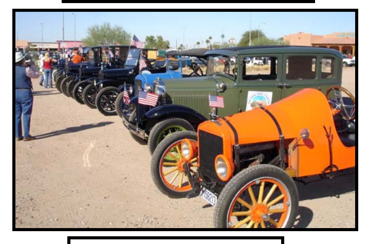
Veterans Day Parade Lineup