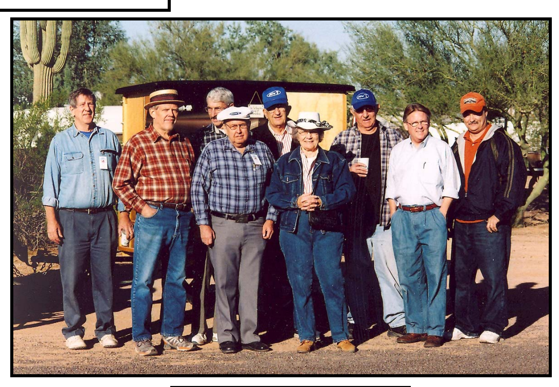
Lookin' good on Veterans Day