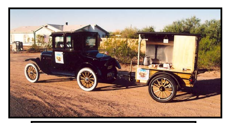
Dave's turn at towing the Chuck Wagon