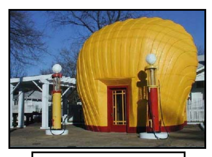
Old Gas Stations—No. 8 in a series