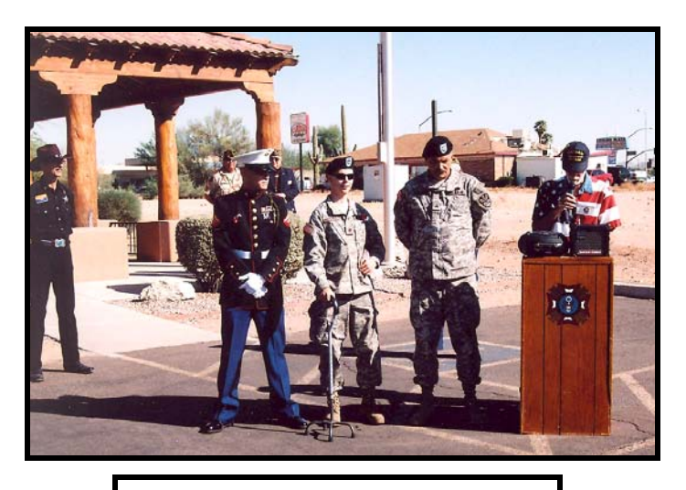
Veterans Day Ceremony Honorees