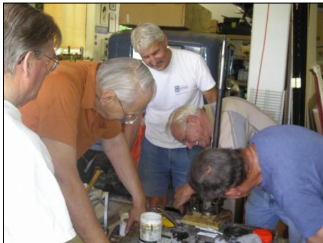
The closer you get, the better it looks!