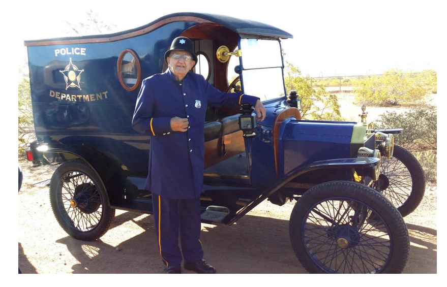
We even had our POLICE force!