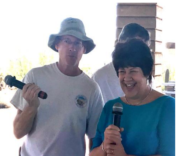
Check out our Facebook page for the video!

www.facebook.com/search/str/east+valley+model+t+ford+club/keywords\_blended\_featured\_posts?esd=eyJlc2lkIjoiUzpfSTMyNDUwODczMTAwNjg1MjpWSzo2MTE4MTc4NzU2MDkyNjgiLCJwc2lkIjp7IjMyNDUwODczMTAwNjg1Mjo2MTE4MTc4NzU2MDkyNjgiOiJVenBmU1RNeU5EVXdPRGN6TVRBd05qZzFNanBXU3pvMk1URTRNVGM0TnpVMk1Ea3lOamc9In0sImNyY3QiOiJ0ZXh0IiwiY3NpZCI6ImFhZWYxOWMxODg0NjczMWVjYjA2ZDAzZjA0MzkyZmNkIn0%3D