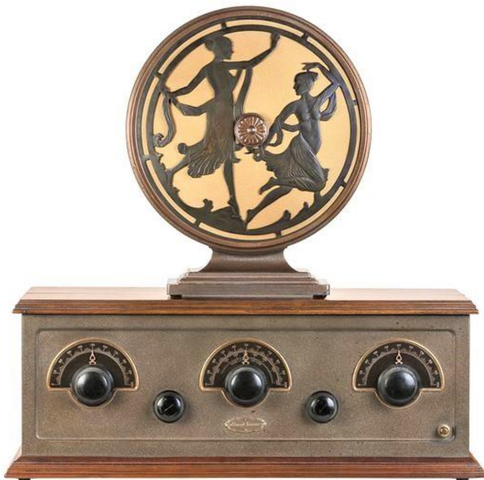
1925 Stewart Warner Model 300 Radio