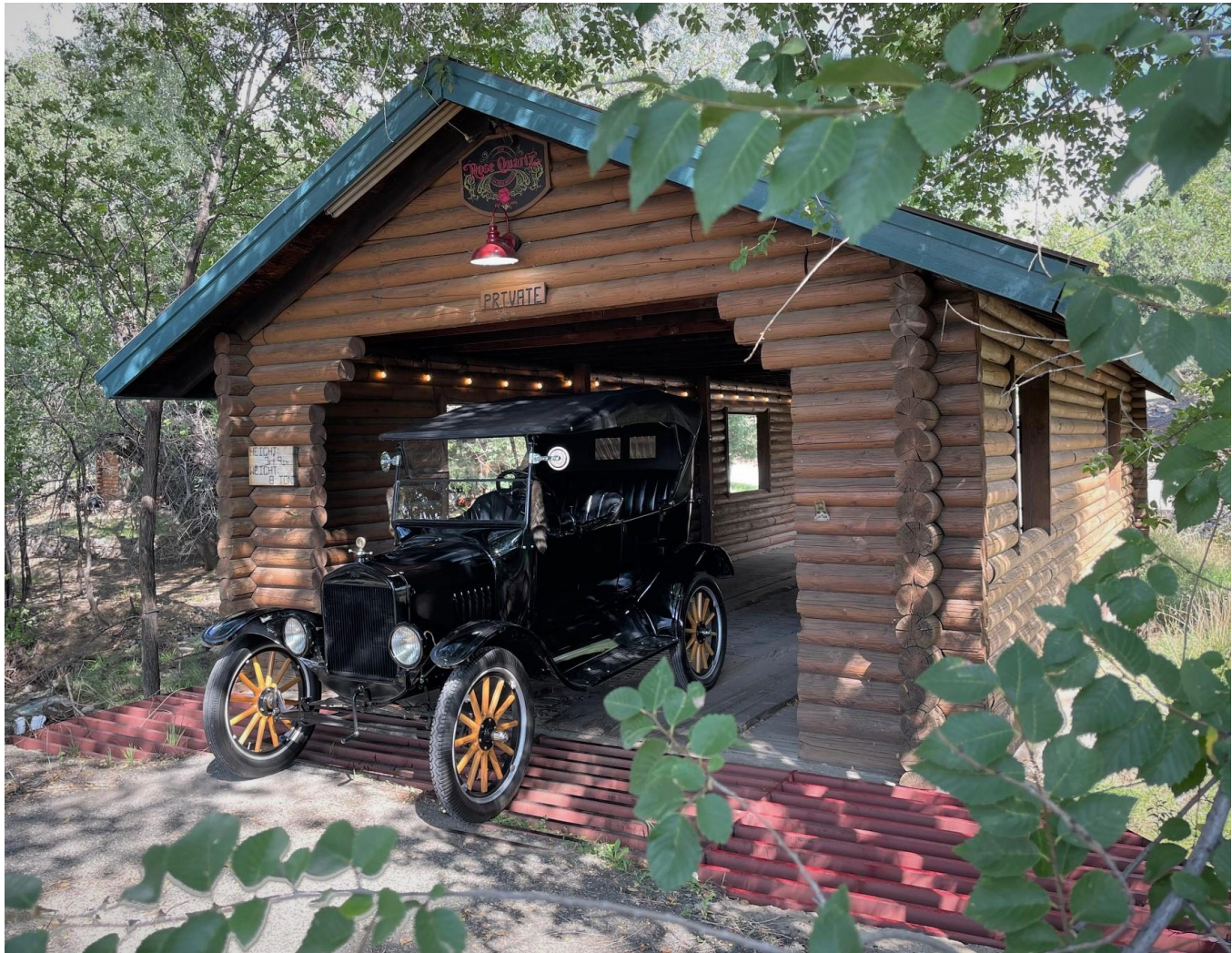
This is a private covered bridge in Prescott Arizona!