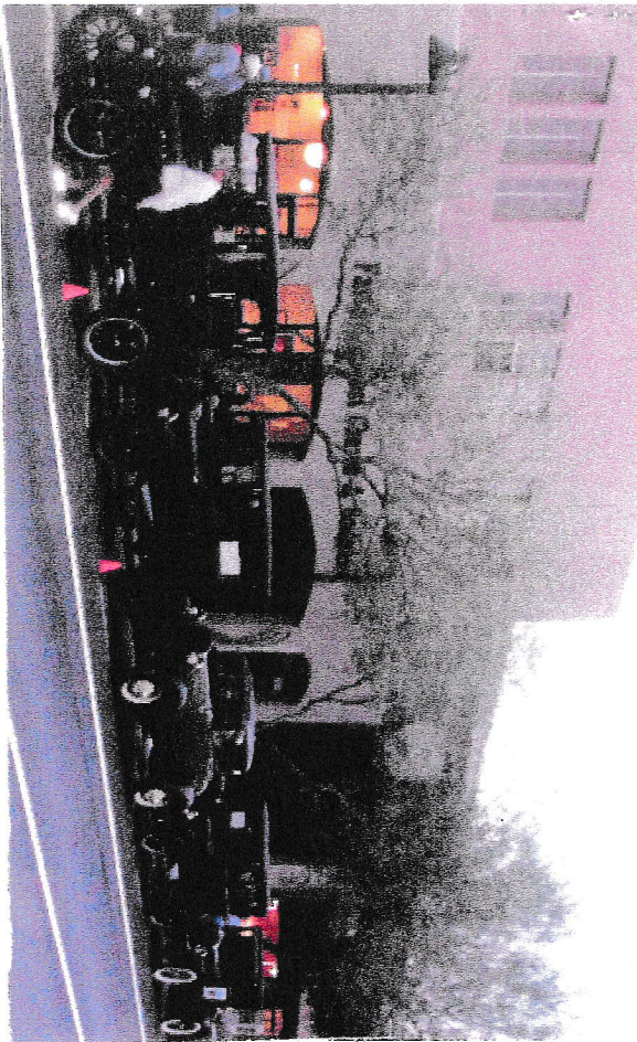
← Mesa Cruise Night →