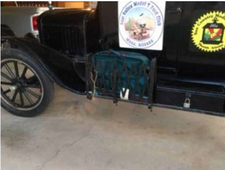
I have a luggage Rack to carry all my overnight things!