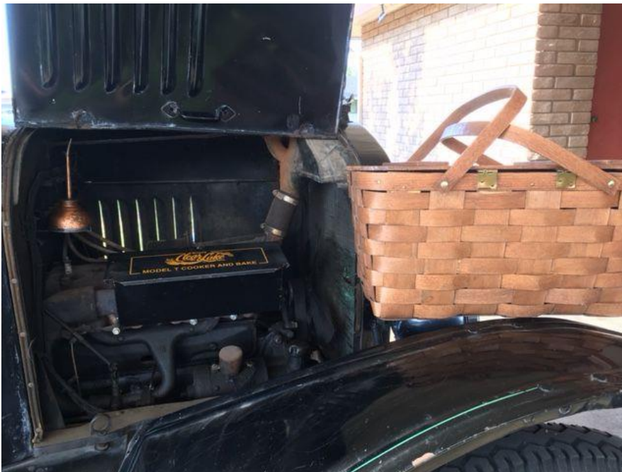
I have a very nice picnic basket

I don't want to toot my horn (a-oo-ga), but I am rather versatile—one might even say a renaissance gal. These clips might highlight some of my abilities. I can be a comfortable touring coach, a dinning coach, a sleeper, a luggage car and a roadside service vehicle. I am proud to keep up the Model T tradition.