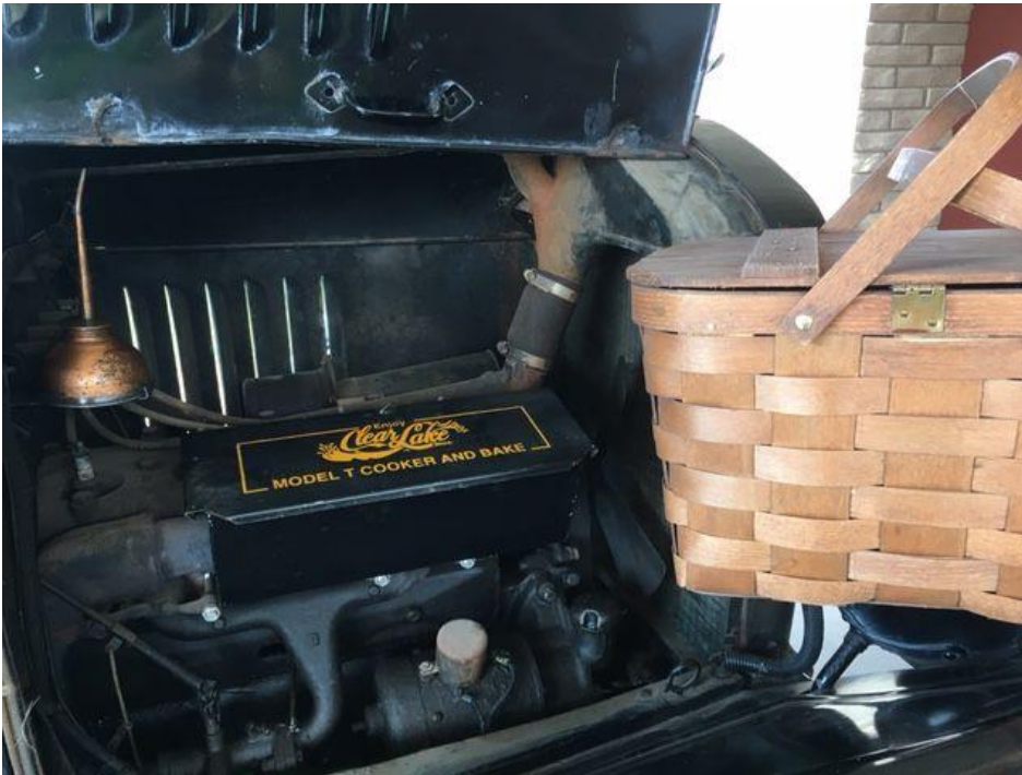
I have a very nice Manifold Cooker