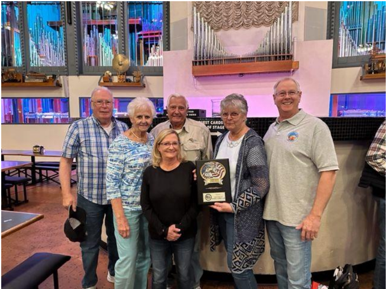
EVMTFC presented Award from Veterans Day Parade Organization for Best Vehicle Entry