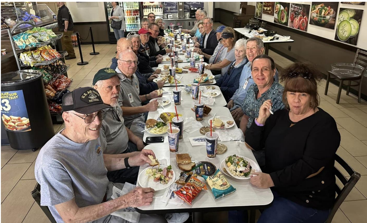
Lunch after the tour at Port of Subs