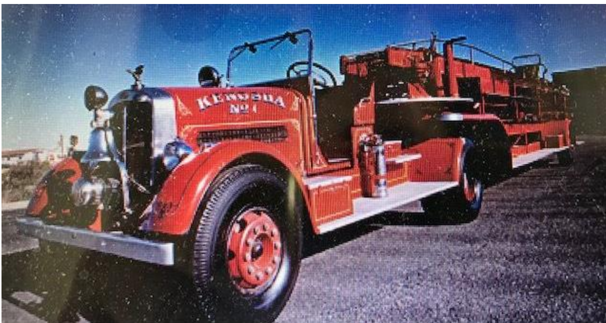
1937 Pirsch 85' ladder truck.