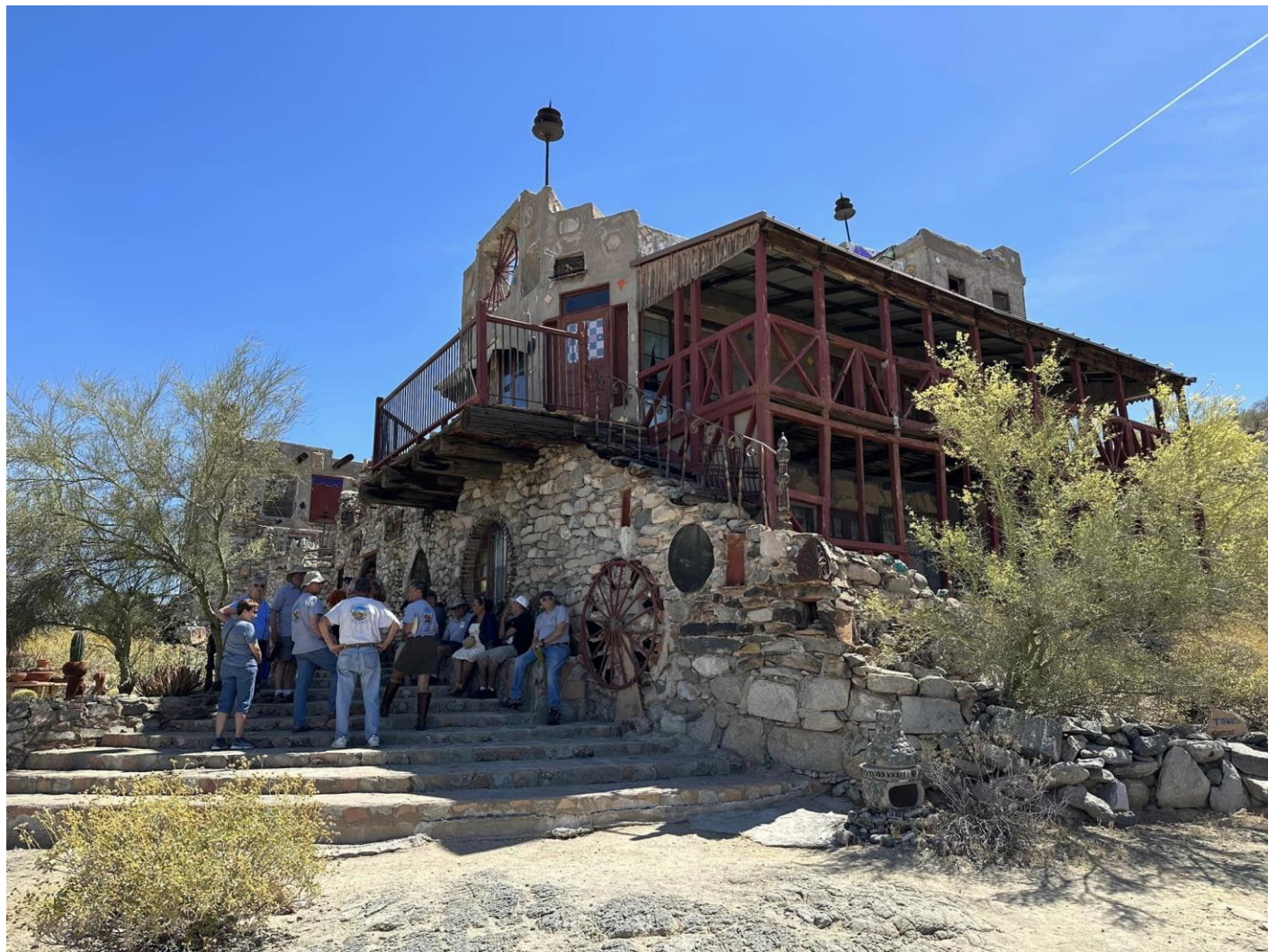
East Valley Model T Ford Club visit to Mystery Castle.