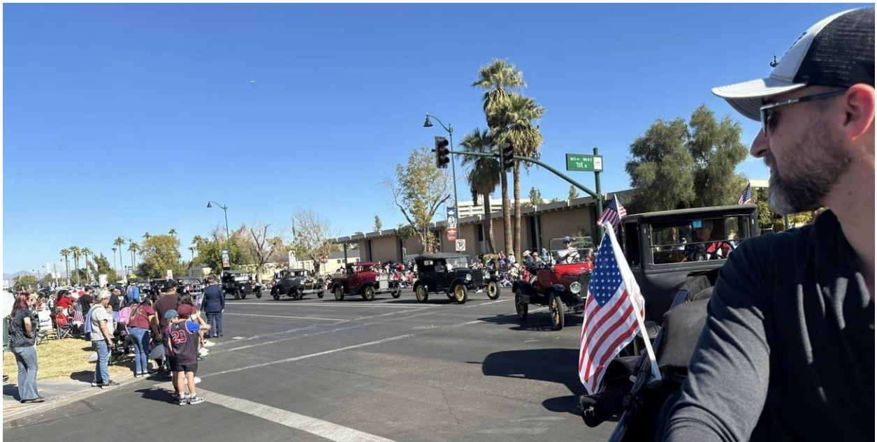
A nice look back of our cars lined-up in the parade