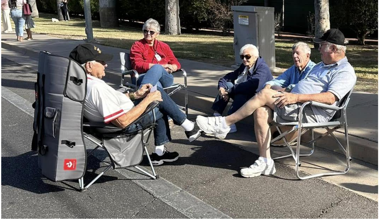
It's always hurry-up and wait.