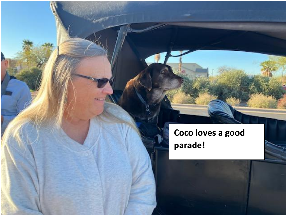
Coco loves a good parade!