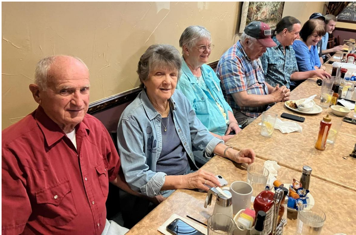
All club photos can be seen on our Facebook page